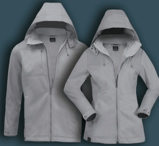
HORIZON JACKET 3048 / 3148